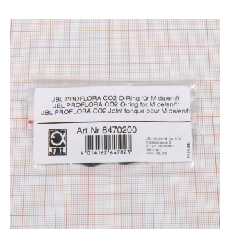
JBL PROFLORA CO2 Oring for m