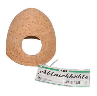
JBL Ceramic spawning cave Ceramic cave for freshwater aquariums