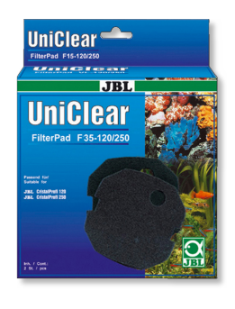
JBL FilterPad F35 Fine foam pad for aquarium filter CristalProfi