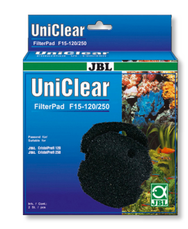
JBL FilterPad F15 Coarse foam pad for aquarium filter ĊristalProfi