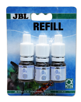
JBL Oxygen Test O2 -New Formula Quick test for the determination of the oxygen content