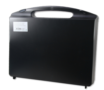
JBL Testlab empty + inserts