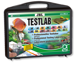
JBL Testlab Test case with 13 tests f. freshwater analysis Testlab