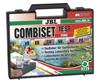
JBL Test Combi Set Pond

The most important water tests for garden ponds