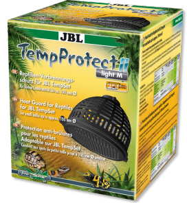
JBL TempProtect II light Reptile thermal burn protection for JBL TempSet items