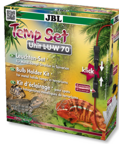
JBL TempSet Unit L-U-W Installation kit for metal-halide lamps