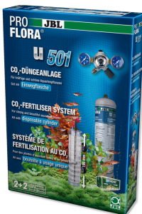
JBL PROFLORA u501 Plant fertiliser system complete kit