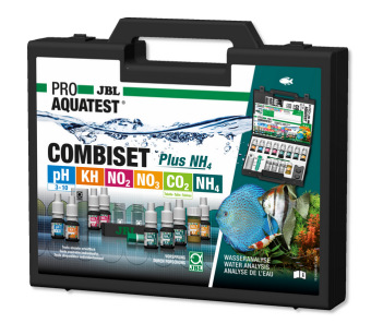
JBL PROAQUATEST COMBISET Plus NH4 Test case with most important water tests + NH4 test