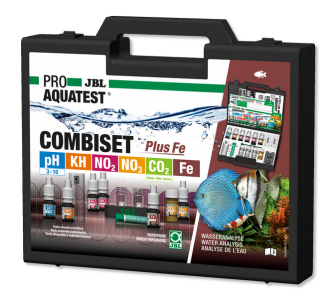
JBL PROAQUATEST COMBISET Plus Fe Test case with most important water tests + iron test