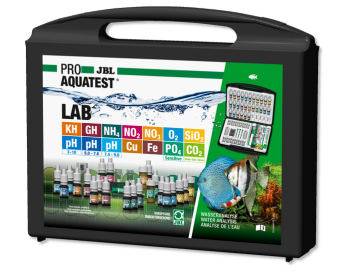
JBL PROAQUATEST LAB Test case with 13 water tests for freshwater analysis