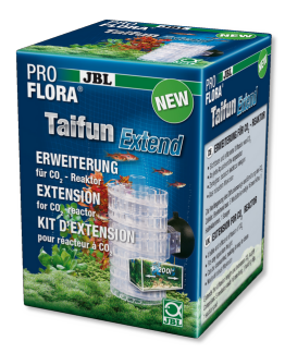
JBL PROFLORA Taifun Extend

Extension for CO2 high-performance diffuser