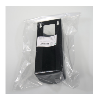
JBL PF CO2 BIO THERMAL CASING