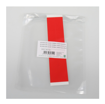
JBL PF CO2 BIO THERMAL CASING adhesive tape