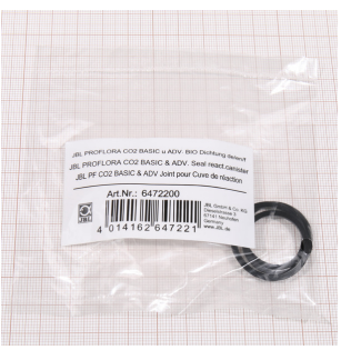
JBL PF CO2 BIO REAKTOR seal