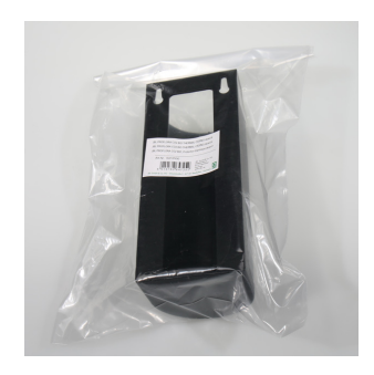
JBL PF CO2 BIO THERMAL CASING

or Bio-CO2 fertiliser Systems Systems SIAIFUN TUBE IAIFUN TUBE Dedicated CO2-resistant hose for aquariums