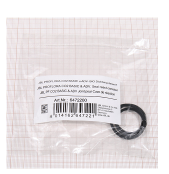
JBL PF CO2 BIO REAKTOR seal