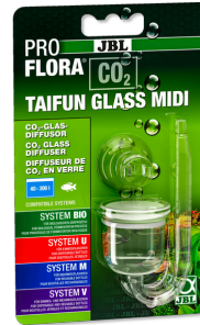
JBL PROFLORA CO2 TAIFUN GLASS Glass CO2 diffuser for freshwater tanks from 40-300 l