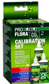
JBL PROFLORA CO2 CALIBRATION SET To calibrate and store pH electrodes