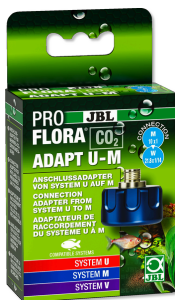
JBL PROFLORA CO2 ADAPT U - M CO2 conversion adapter disposable to refillable bottle