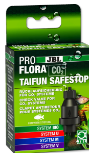
JBL PROFLORA CO2 TAIFUN SAFESTOP Water backflow protection for CO2 systems