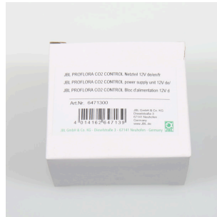
JBL PF CO2 CONTROL power supply unit 12V