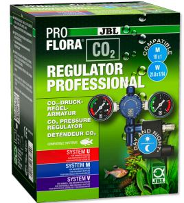
JBL PROFLORA CO2 REGULATOR PROFESSIONAL Pressure regulator with 2 displays & valve for CO2