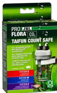
JBL PROFLORA CO2 TAIFUN COUNT SAFE CO2 bubble counter with built-in check valve