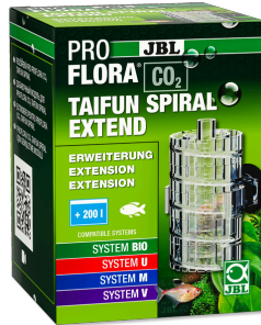
JBL PROFLORA CO2 TAIFUN SPIRAL EXTEND Extension for JBL PROFLORA CO2 TAIFUN SPIRAL 5 / 10