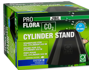
JBL PROFLORA CO2 CYLINDER STAND Stand for 500 g CO2 cylinders