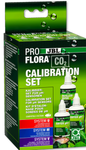
JBL PROFLORA CO2 CALIBRATION SET To calibrate and store pH electrodes