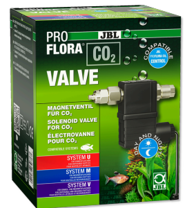
JBL PROFLORA CO2 VALVE CO2 solenoid valve for regulated CO2 addition