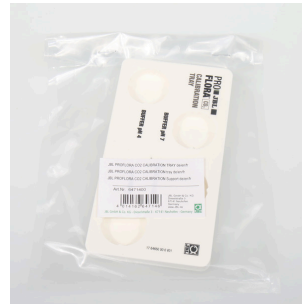
JBL PF CO2 CALIBRATION tray To keep the cuvettes upright during calibration