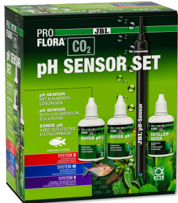
JBL PROFLORA CO2 pH SENSOR SET pH electrode, labor. quality for almost all pH devices