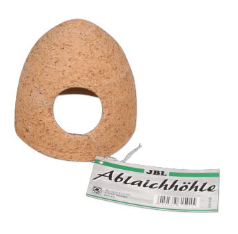
JBL Ceramic spawning cave Ceramic cave for freshwater