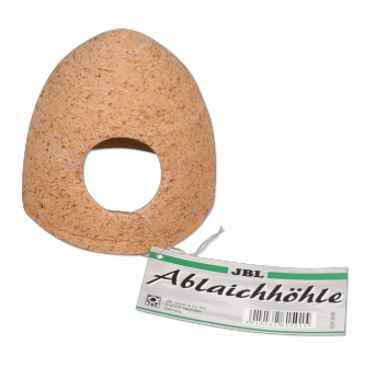
JBL Ceramic spawning cave Ceramic cave for freshwater aquariums