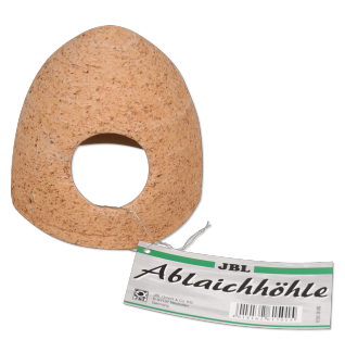
JBL Ceramic spawning cave Ceramic cave for freshwater aquariums