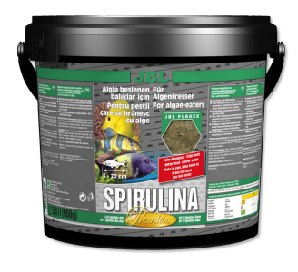
JBL Spirulina Premium main food for algaeeating aquarium fish