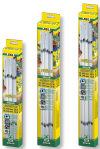
JBL SOLAR Reflect T5/ T8 - 895-1500 mm Reflector panel for fluorescent tube