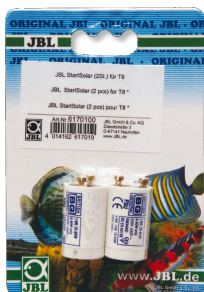
JBL Start Solar Starter for T8 fluorescent tubes