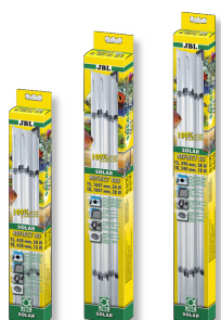
JBL SOLAR Reflect T5/ T8 - 895-1500 mm Reflector panel for fluorescent tube