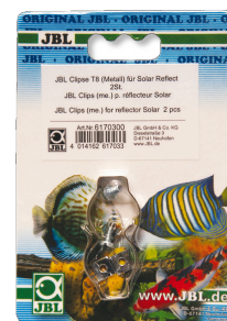
JBL Clips T5/T8 (Metal) Metal holder for fluorescent tubes