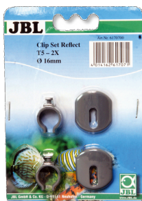
JBL SOLAR REFLECT Clip Set Holder for fluorescent tubes