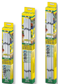
JBL SOLAR Reflect T5/ T8 - 895-1500 mm Reflector panel for fluorescent tube