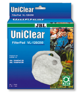
JBL FilterPad VL Cotton fleece for CristalProfi aquarium filters