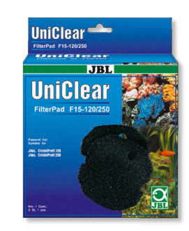
JBL FilterPad F15 Coarse foam pad for aquarium filter ĊristalProfi