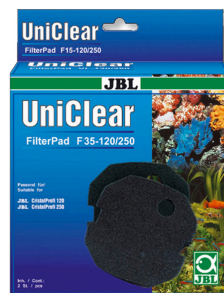
JBL FilterPad F35 Fine foam pad for aquarium filter CristalProfi