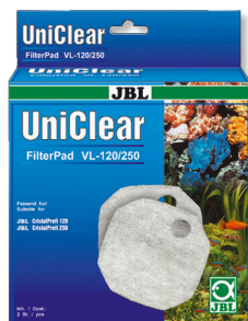
JBL FilterPad VL Cotton fleece for CristalProfi aquarium filters