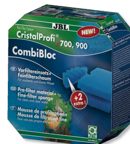
JBL CombiBloc CristalProfi e Pre-filter pads and filter foam for CristalProfi e