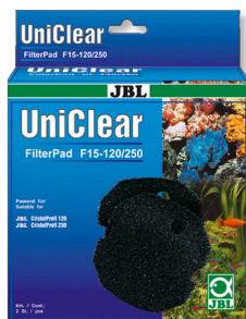
JBL FilterPad F15 Coarse foam pad for aquarium filter CristalProfi