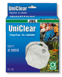
JBL FilterPad VL Cotton fleece for CristalProfi aquarium filters