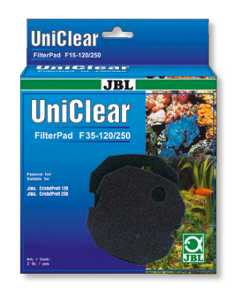
JBL FilterPad F35 Fine foam pad for aquarium filter CristalProfi