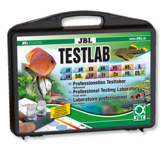
JBL Testlab Test case with 13 tests f. freshwater analysis Testlab

Test case with most important water tests + iron test