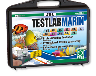
JBL Testlab Marin Professional test case for the analysis of saltwater