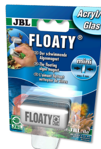
JBL FLOATY acrylic/ glass Floating acrylic pane cleaning magnet