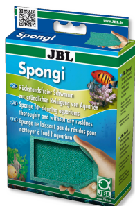
JBL Spongi Cleaning sponge for aquariums and terrariums