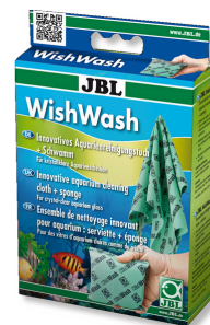
JBL WishWash Cleaning cloth and sponge