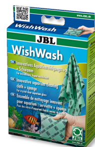
JBL WishWash Cleaning cloth and sponge