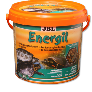
JBL Energil Main food for turtles and pond terrapins