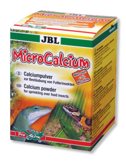
JBL MicroCalcium Mineral supplementary food for all reptiles