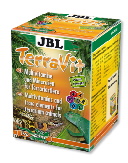
JBL TerraVit Powder Vitamins and trace elements for terrarium animals