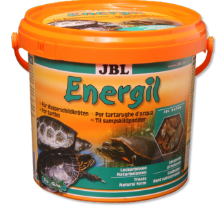
JBL Energil Main food for turtles and pond terrapins