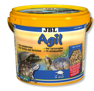
JBL Agil Main foodsticks for turtles 10 -50 cm in size