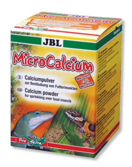
JBL MicroCalcium Mineral supplementary food for all reptiles