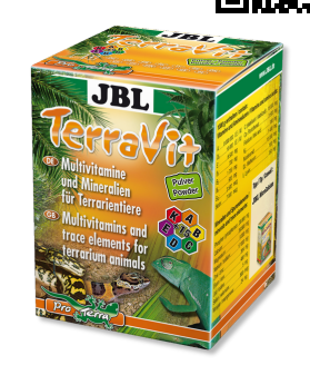
JBL TerraVit Powder Vitamins and trace elements for terrarium animals