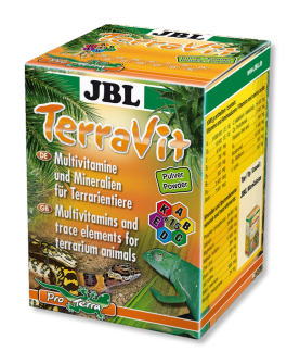
JBL TerraVit Powder Vitamins and trace elements for terrarium animals