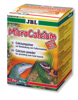
JBL MicroCalcium Mineral supplementary food for all reptiles