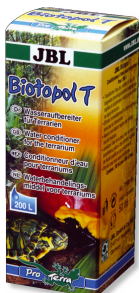
JBL Biotopol T Water conditioner for terrariums