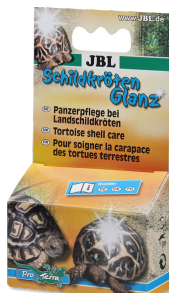
JBL Tortoise shell care Shell care for tortoises