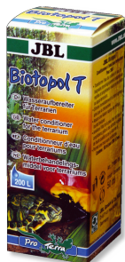
JBL Biotopol T Water conditioner for terrariums