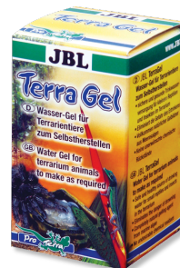
JBL TerraGel Water gel for terrarium animals