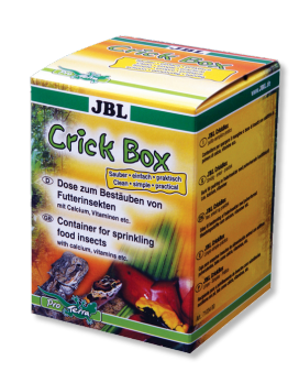
JBL CrickBox Shaker box to sprinkle powder on feeder insects