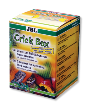
JBL CrickBox Shaker box to sprinkle powder on feeder insects