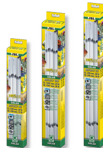
JBL SOLAR Reflect T5/ T8 - 895-1500 mm Reflector panel for fluorescent tube