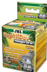
JBL ReptilDay Halogen Halogen spotlight with daylight full spectrum