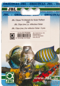
JBL Clips T5/T8 (Metal) Metal holder für fluorescent tubes