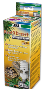
JBL ReptilDesert UV Light Energy-saving lamp for desert terrariums