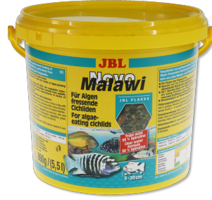
JBL NovoMalawi Main food flakes for algaeeating cichlids