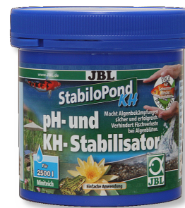
JBL StabiloPond KH pH balancer for garden ponds