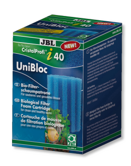
JBL CP i40/TekAir UniBloc blue Foam cartridge for Cristal Profi i40 and TekAir