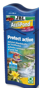
JBL AccliPond Water conditioner for ponds