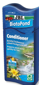
JBL BiotoPond Water conditioner for ponds