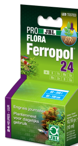
JBL PROFLORA Ferropol 24

Plant fertiliser for freshwater aquariums