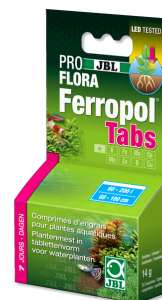
JBL PROFLORA Ferropol Tabs

Daily plant fertiliser for freshwater aquariums