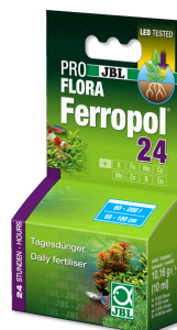
JBL PROFLORA Ferropol 24

Plant fertiliser for freshwater aquariums