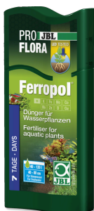
JBL PROFLORA Ferropol

Plant fertiliser for freshwater aquariums