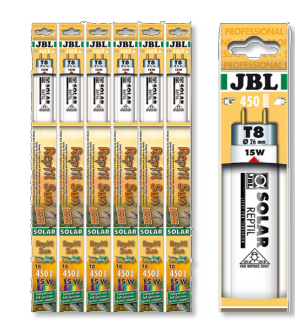
JBL SOLAR REPTIL SUN Τ8 Special T8 terrarium fluoresc. tube for desert animals