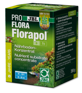
JBL PROFLORA Florapol Long-term nutrient substrate concentrate

Root fertiliser for freshwater aquariums