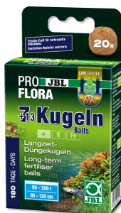
JBL PROFLORA 7 + 13 Balls Root fertiliser for freshwater aquariums