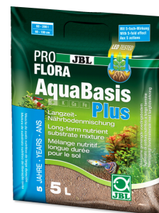
JBL PROFLORA AquaBasis plus Long-lasting nutrient substrate f. freshwater aquarium