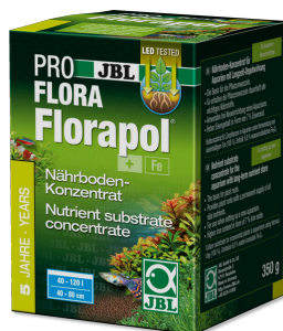
JBL PROFLORA Florapol Long-term nutrient substrate concentrate