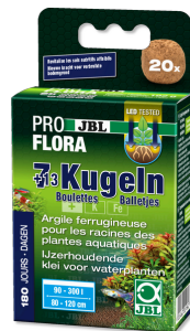
JBL PROFLORA 7 + 13 Balls Root fertiliser for freshwater aquariums