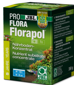
JBL PROFLORA Florapol Long-term nutrient substrate concentrate