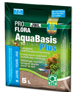
JBL PROFLORA AquaBasis plus Long-lasting nutrient substrate f. freshwater aquarium