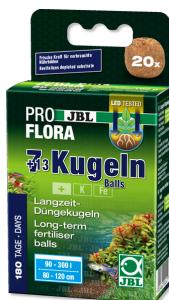
JBL PROFLORA 7 + 13 Balls Root fertiliser for freshwater aquariums