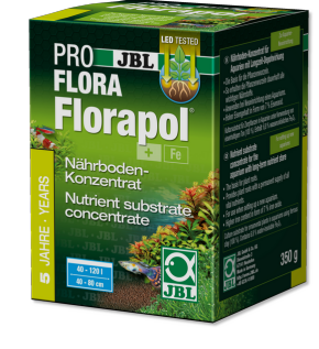
JBL PROFLORA Florapol Long-term nutrient substrate concentrate